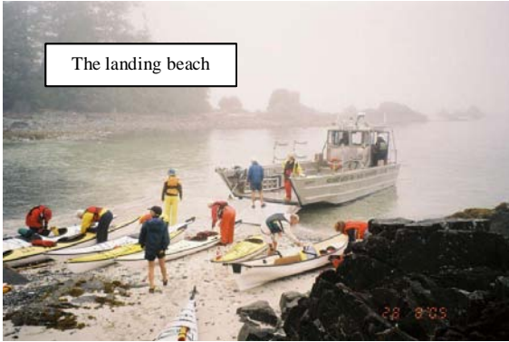
The landing beach