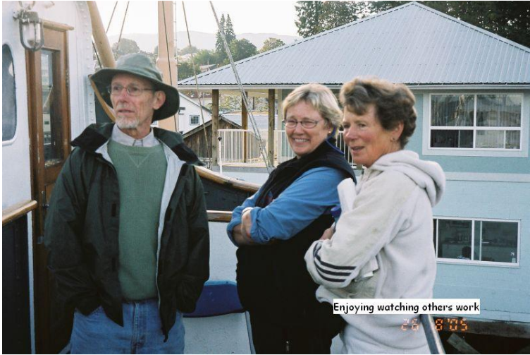
The loading was carefully supervised by KVPC members

The trip out to Sechart Lodge gave the members chance to enjoy the scenery and to get to know each other a little better.