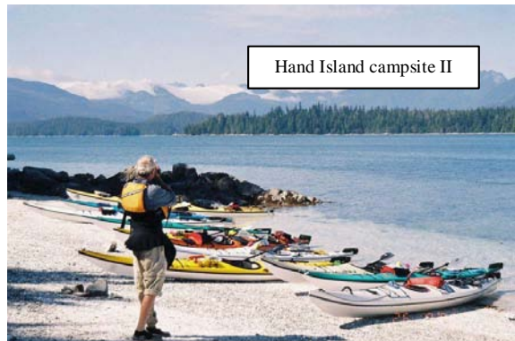
Hand Island campsite II