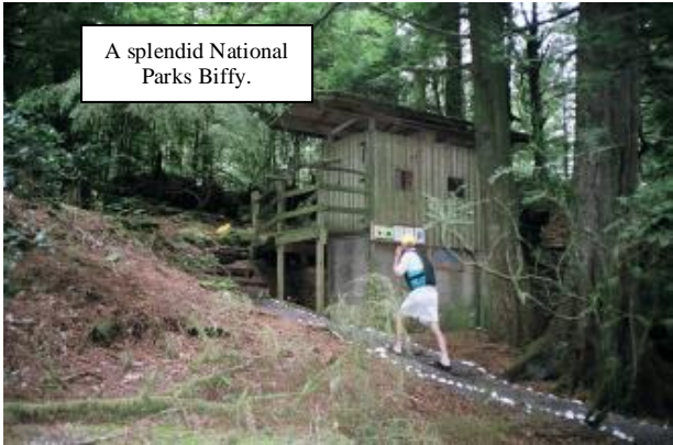
A splendid National Parks Biffy.