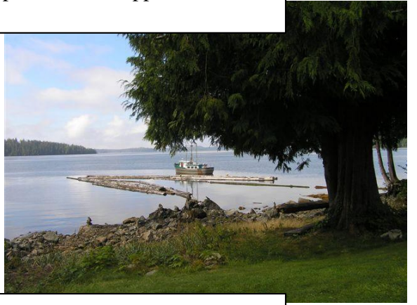
For Sunday, Brian had arranged a water taxi trip out to one of the small islands between Lovett and Trickett islands. Fog delayed us for a while, but the trip out and the paddle back to the lodge gave most of us our highlight of the trip. The next eight pictures illustrate a wonderful day.