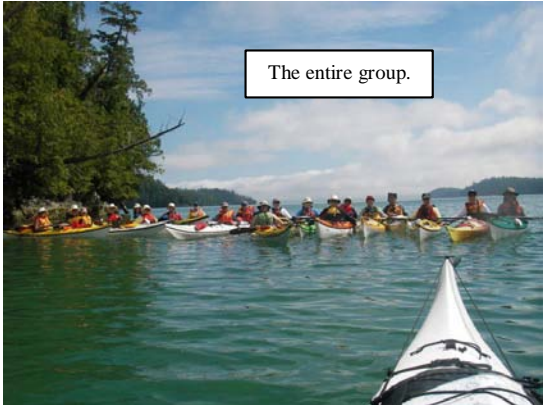
The entire group.