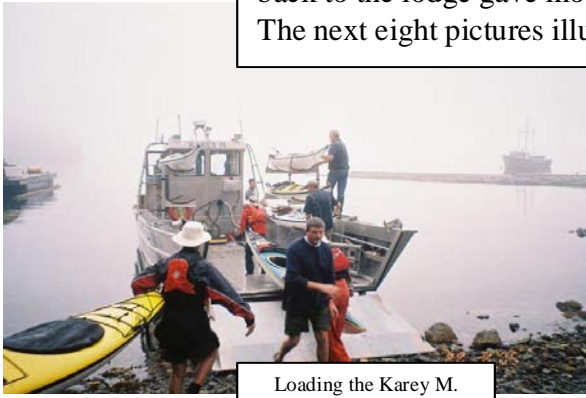
Loading the Karey M.