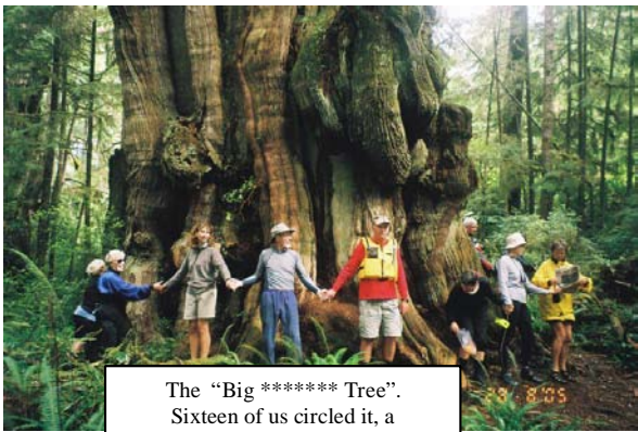
The "Big ***** Tree". Sixteen of us circled it, a circumference of about 64 feet.