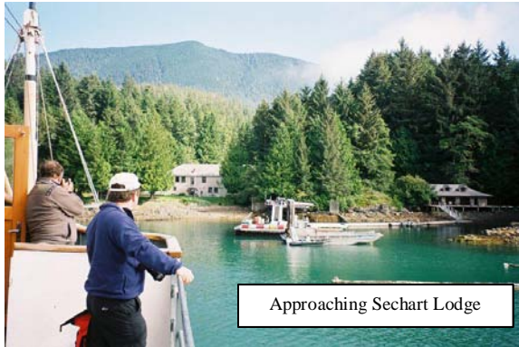
Approaching Sechart Lodge

Sechart Lodge is just outside the NE edge of the Broken Group Islands. The Frances Barkley stops at the lodge both on its out going and return trips. We were quickly unloaded and met by one of the National Park staff for a safety and environmental briefing. The afternoon was spent on a short introductory paddle through the Pinkerton Islands and to the spectacular Hand Island campsite.