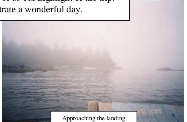
Approaching the landing beach.