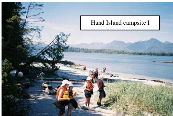
Hand Island campsite I